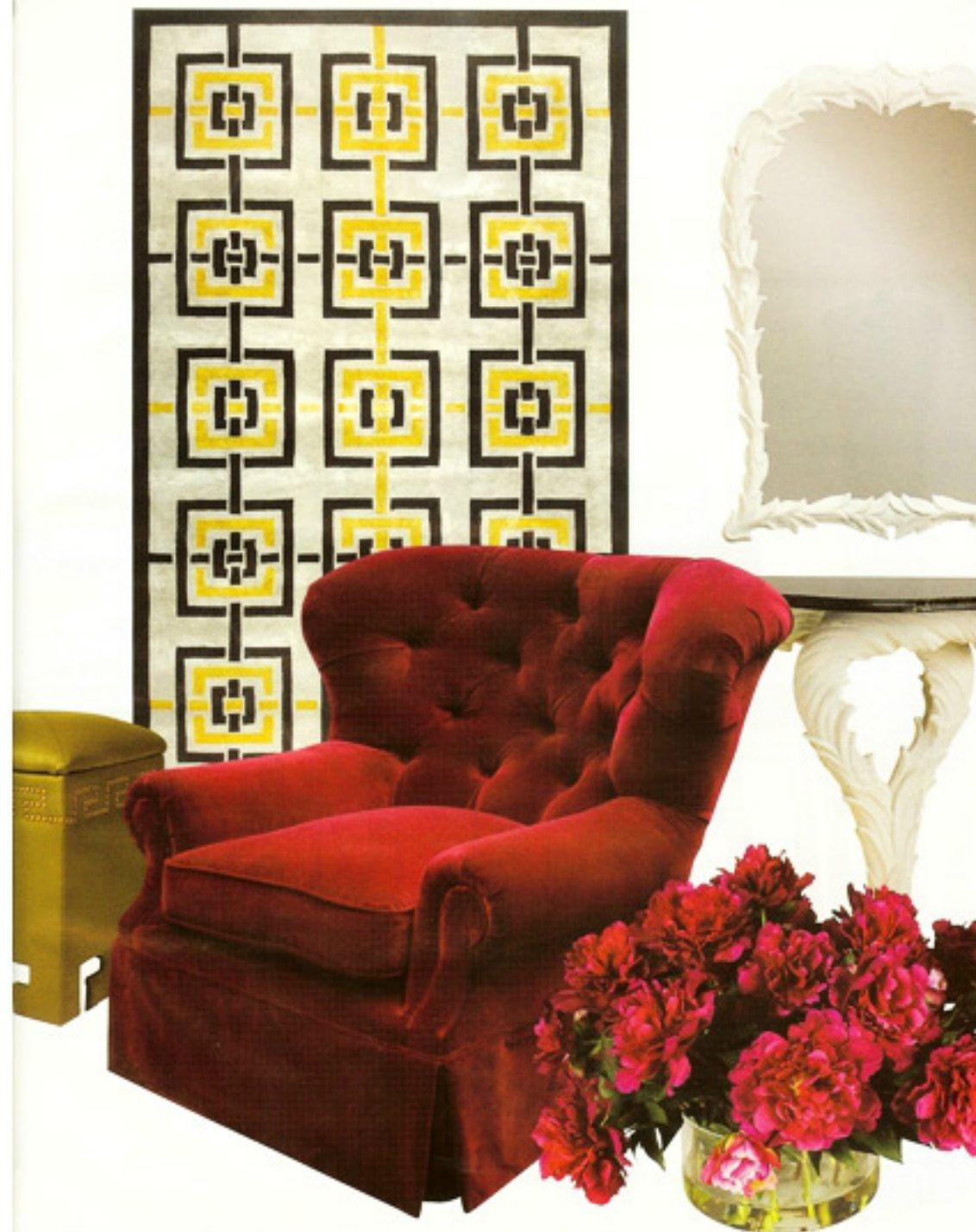
CHAIR Tufted and overscale, Barclay Butera Home 's plush velvet Regency chair caters to both masculine and feminine fancies with its winged club chair design ($4,520)

Dating back to the '30s and continuing well through mid-century, Regency style epitomized the glamour and glitz of the early Hollywood era. Mixing and matching multiple styles, the look represented the beginnings of modern eclecticism in full-blown theatrical fashion. Today, the Regency revival is no less fresh and relevant and incorporates hallmarks like bold color schemes, luxury, lacquer, Deco, neoclassic elements, clean lines, chinoiserie, mirrors, bamboo and even a dollop of rococo. Moreover, it's a lavish ode to the luxurious lifestyle, and a highly aspirational one at that. — Tracy Bulla